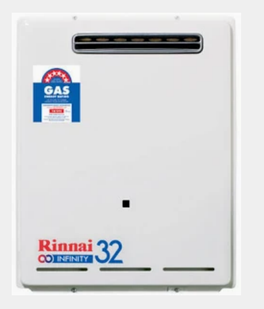
RINNAI HOT WATER SYSTEM