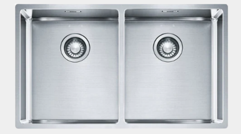
DOUBLE BOWL SINK